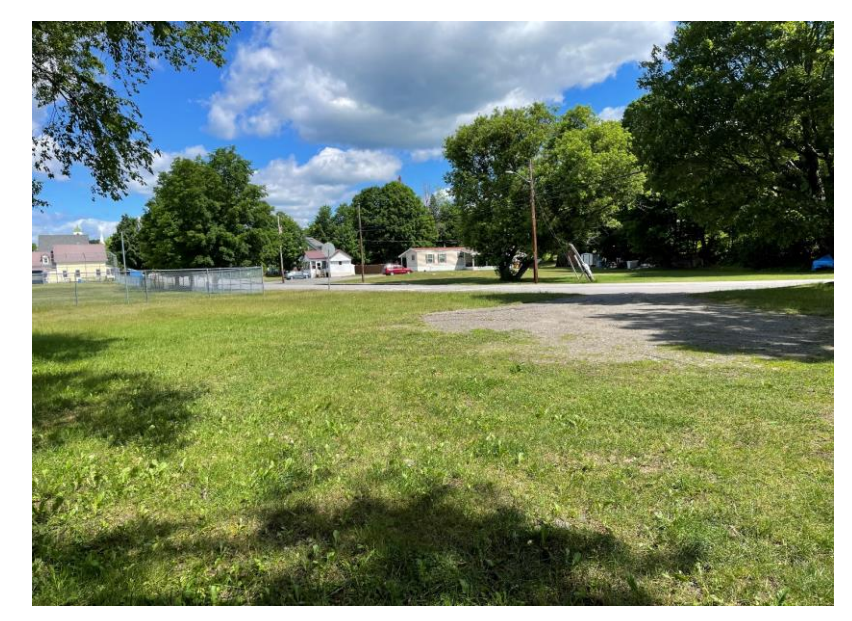
Stratford River Launch Staging Area at site of DV-01 (June 2021)